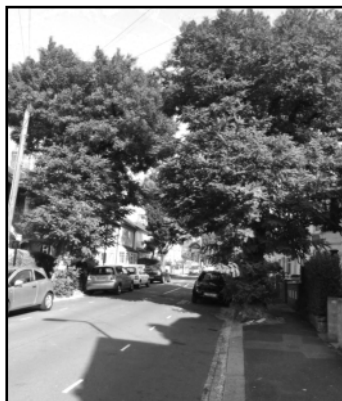
Massive trees in Chesterfield Road