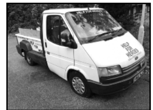
Abandoned van in Gregg Close

The Focus Team has got assurances from the East Thames local officer that unsocial behaviour, maintenance, repairs and dumped rubbish will get dealt with and the van that has been dumped in the Close for 4 years will be removed. Removing a van after 4 years being reported cannot be seen as a success for East Thames but it is something.